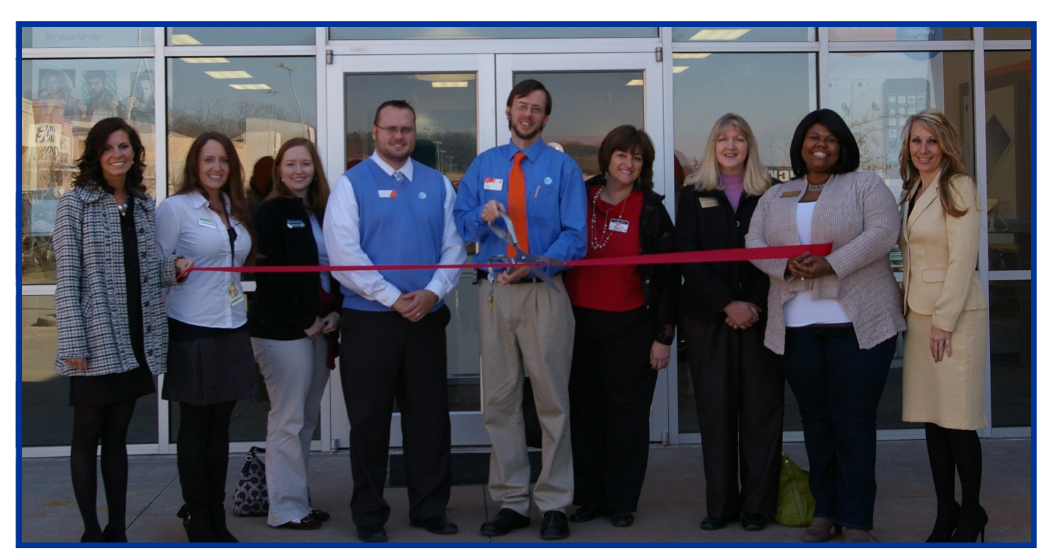
Ribbon Cutting for Apex Communications at the Fort Smith Pavilion (next to Best Buy)

Being a Chamber Ambassador puts you and your business in the spotlight! That gives your company free publicity as a supporter of new businesses coming to the region.