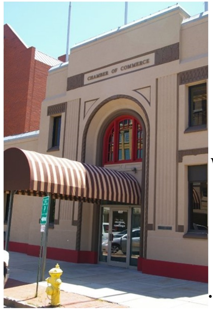
The Fort Smith Regional Chamber of Commerce